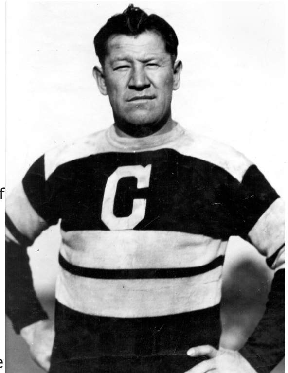
The Legendary Jim Thorpe

While the Bulldogs are no longer around, pro football remembers its early days in Canton, Ohio. Visitors, young and old, enjoy the story of pro football's history in the city where the NFL began!