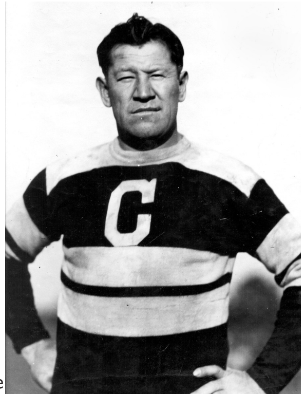
The Legendary Jim Thorpe

While the Bulldogs are no longer around, pro football remembers its early days in Canton, Ohio. Visitors, young and old, enjoy the story of pro football's history in the city where the NFL began!