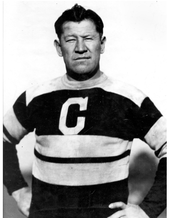
The Legendary Jim Thorpe

While the Bulldogs are no longer around, pro football remembers its early days in Canton, Ohio. Visitors, young and old, enjoy the story of pro football's history in the city where the NFL began!