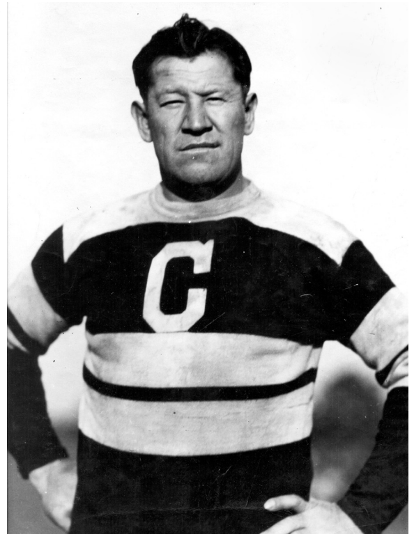
The Legendary Jim Thorpe

While the Bulldogs are no longer around, pro football remembers its early days in Canton, Ohio. Visitors, young and old, enjoy the story of pro football's history in the city where the NFL began!