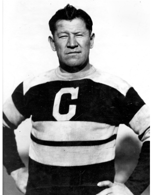
The Legendary Jim Thorpe

While the Bulldogs are no longer around, pro football remembers its early days in Canton, Ohio. Visitors, young and old, enjoy the story of pro football's history in the city where the NFL began!