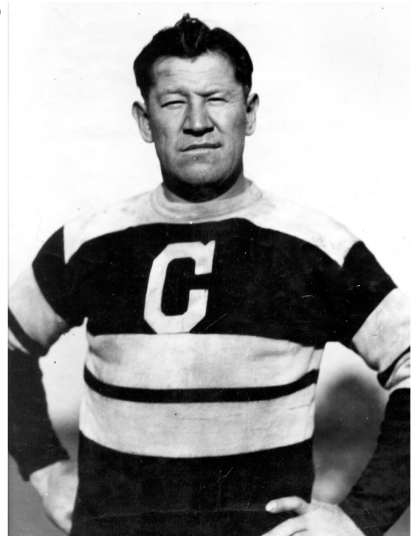
The Legendary Jim Thorpe

While the Bulldogs are no longer around, pro football remembers its early days in Canton, Ohio. Visitors, young and old, enjoy the story of pro football's history in the city where the NFL began!